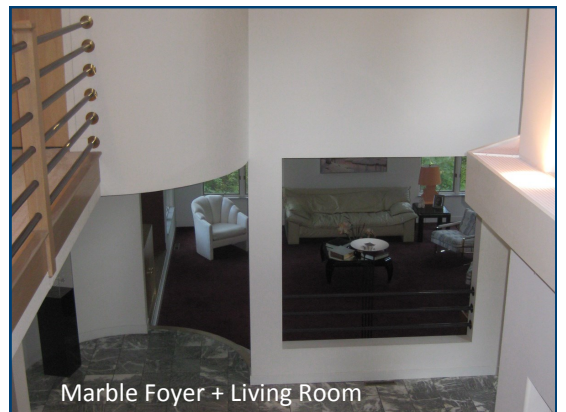
Marble Foyer + Living Room