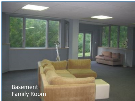
Basement Family Room